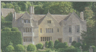
◆ ABOVE: Owlpen Manor near Uley ZSEM443H05