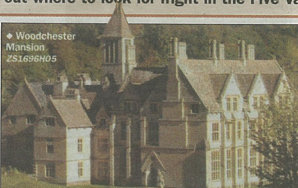
◆ Woodchester Mansion ZSEM5505H05