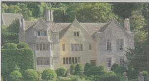
◆ ABOVE: Owlpen Manor near Uley ZSEM4443H05