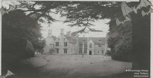
◆ Chavenage House near Tetbury SMW2232H05