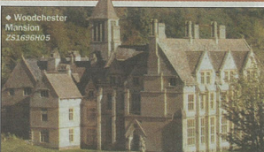
◆ Woodchester Mansion ZSEM550H05

There have been many reports of sightings of paranormal activity in the Stroud area over the centuries. Here's a run-down of the Five Valleys very own Most Haunted.