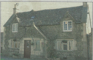
◆ The Ragged Cot at Chalford SCL2297H05